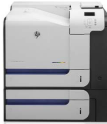
HP LaserJet Enterprise 500 color M551 printer series

The following table compares the new HP LaserJet Enterprise 500 color M551 printer series with the HP Color LaserJet CP3520 Printer series: