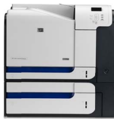
HP Color LaserJet CP3520 Printer series